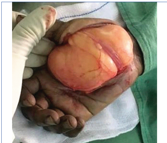
[Table/Fig-4]: Lipoma stretching thenar muscle

indentation of tumour beneath that muscle [Table/Fig-4]. Thenar muscles were found atrophied and nerves were found stretched. Careful dissection using magnification was done to preserve the muscles and neurovascular pedicles [Table/Fig-5]. Excess skin was removed and wound was closed in layer after keeping suction drain [Table/Fig-6].