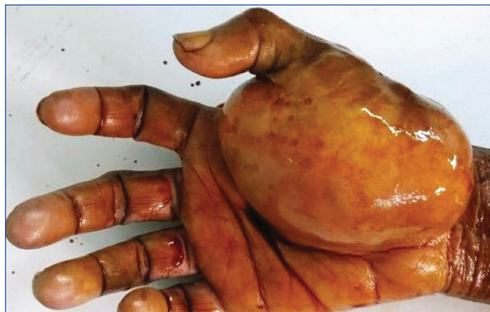
[Table/Fig-1]: Clinical picture.

On examination, there was a well-defined lobular mass of size 8×7 cm occupying entire right thenar eminence. It was firm and non-mobile. Thumb movements were full. She was able to oppose the thumb to other fingers with difficulty but a firm grip could not be made [Table/Fig-1]. Clinical diagnosis of Lipoma was made.