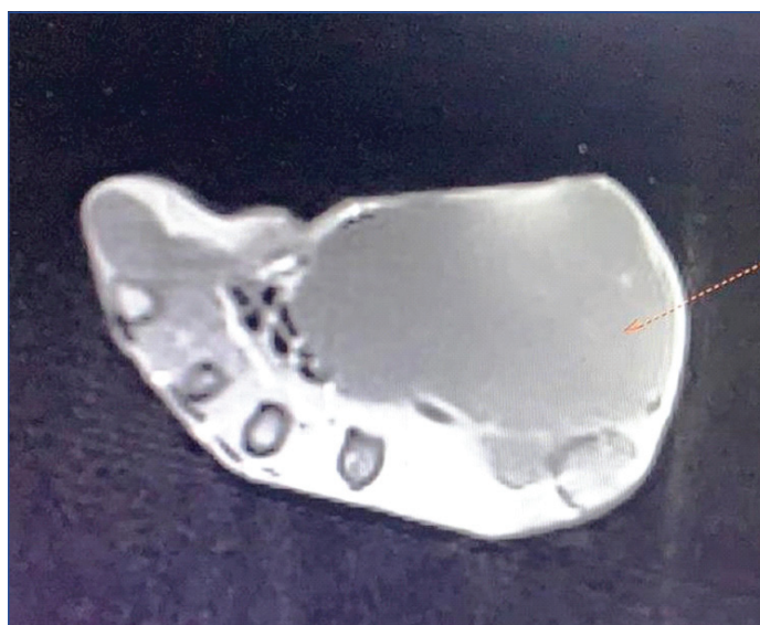
[Table/Fig-3]: MRI of hand.