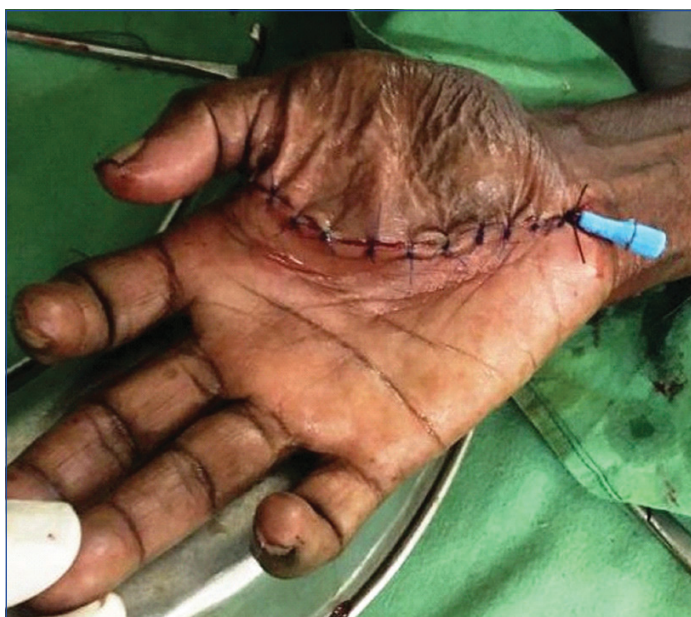
[Table/Fig-6]: Postoperative result.

Specimen was sent for histopathological examination. The H&E stained multiple sections showed a benign mesenchymal neoplasm composed of lobules of fat cells separated by thin fibrous septa suggestive of Lipoma [Table/Fig-7]. Postoperatively, the thumb function was full and active with no neurovascular deficit. She was able to oppose the fingers without difficulty and able to make complete fist. Grip strength was also improved.