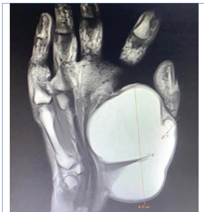
[Table/Fig-2]: MRI of the hand showing the intense mass lesion of size 8.1×4.9×6.7 cm.

Surgical removal was planned as the tumour was big and interfered with her thumb movements. Surgery was done under supraclavicular block with tourniquet control. On exploration, a firm multi lobulated yellowish tumour found in between the thenar muscles. Flexor pollicis brevis muscle was found to be stretched. There was an