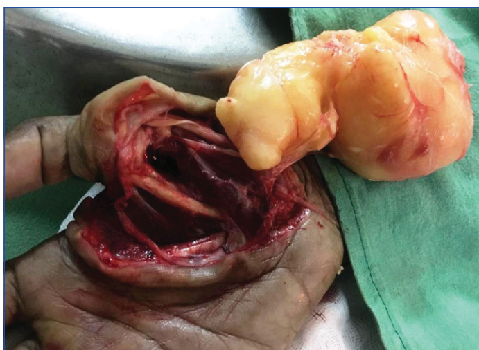
[Table/Fig-5]: Lipoma excision done preserving structures.